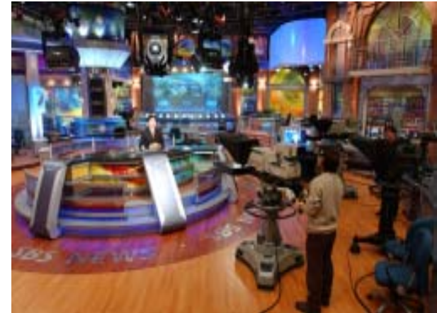
Figure 2: SBS news studio

Underpinning all of this is a Media Asset Management system provided by KONAN which provides comprehensive cataloging, retrieval and workflow management capabilities. The KONAN environment is built of four main components, all of them developed by KONAN: