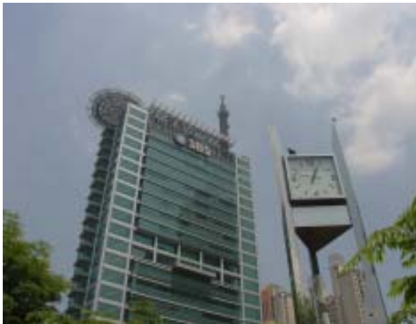
New SBS headquarters

This is why considerable attention is now being paid to the asset-management based news production system in operation at SBS in Korea. SBS is Korea's largest commercial broadcaster, delivering its programmes via Television (terrestrial, cable, and satellite, and including an HD service) and Radio. It is one of three premium channels in Korea, and employs over 1,500 staff.